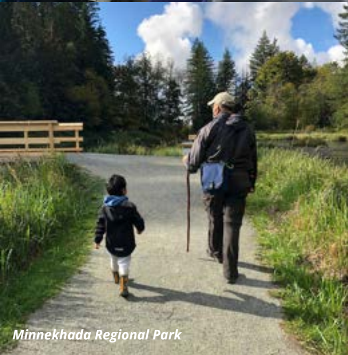
Minnekhada Regional Park